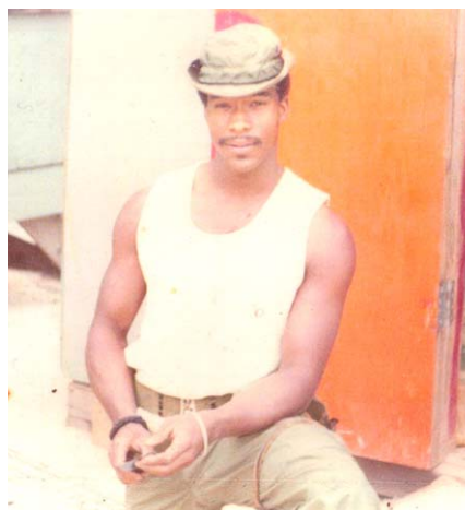
Guess Who??? See back page for the answer